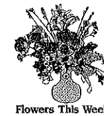
Flowers This Week

Catholic Man Night... The Catholic Men's Fellowship (CMF) will sponsor a "Catholic Man Night" on Friday, December 1 from 6:30 p.m.– 8:45 p.m. at Holy Spirit Church in Uniontown. All men of the Diocese are welcome. This is designed to help 21st century men develop and use their Catholic faith in their daily lives, presented in a way that makes sense to men. For more information call 330-807-2255 by Monday, November 27.